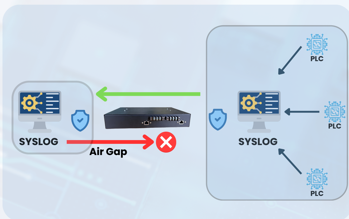
Figure. Uni-directional Solution

Generally, the two networks are connected via 2 firewalls, each at the edge of it's network. Terafence can provide a 100% secure barrier between the two networks to ensure no leakage of Cyber events happen from either end. Terafence SYSLOG product creates a total barrier between the two networks. SYSLOG data can be sent real time to the original destination as before with zero chance of cyber-attack. This will ensure no change of network connectivity topology and no operational impact during or after the installation.